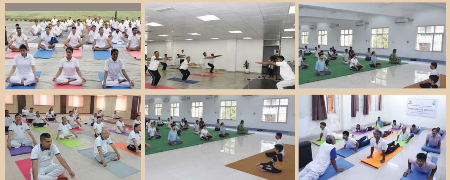
Participants from BPR&D Hqrs and outlying units during Yoga session on International Yoga Day