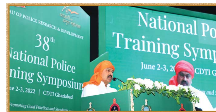
Hon'ble MoS (Home), Sh. Ajay Kumar Mishra Ji giving the valedictory address