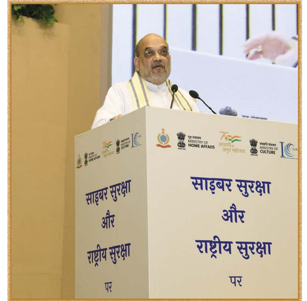
Hon'ble Union Home and Cooperation Minister Shri Amit Shah Ji, addressing the 'National Conference on Cyber Safety and National Security'

Inauguration follows 07 technical sessions taken by the Domain expert from NSCS, Police, RBI, NPCI, DoT MeitY, and NCIIIP, attended by about 400, Chief Information Security Officers and Chief Record Officers.●