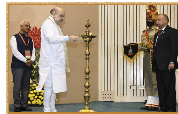
Hon'ble Union Home and Cooperation Minister, Sh. Amit Shah Ji, lighting the lamp