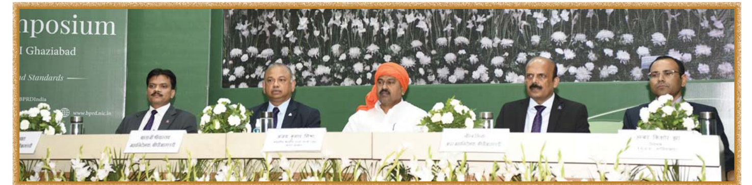
Hon'ble MoS (Home), Sh. Ajay Kumar Mishra ji and other dignitaries at valedictory function