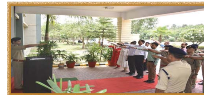
Oath Ceremony at CDTI Ghaziabad