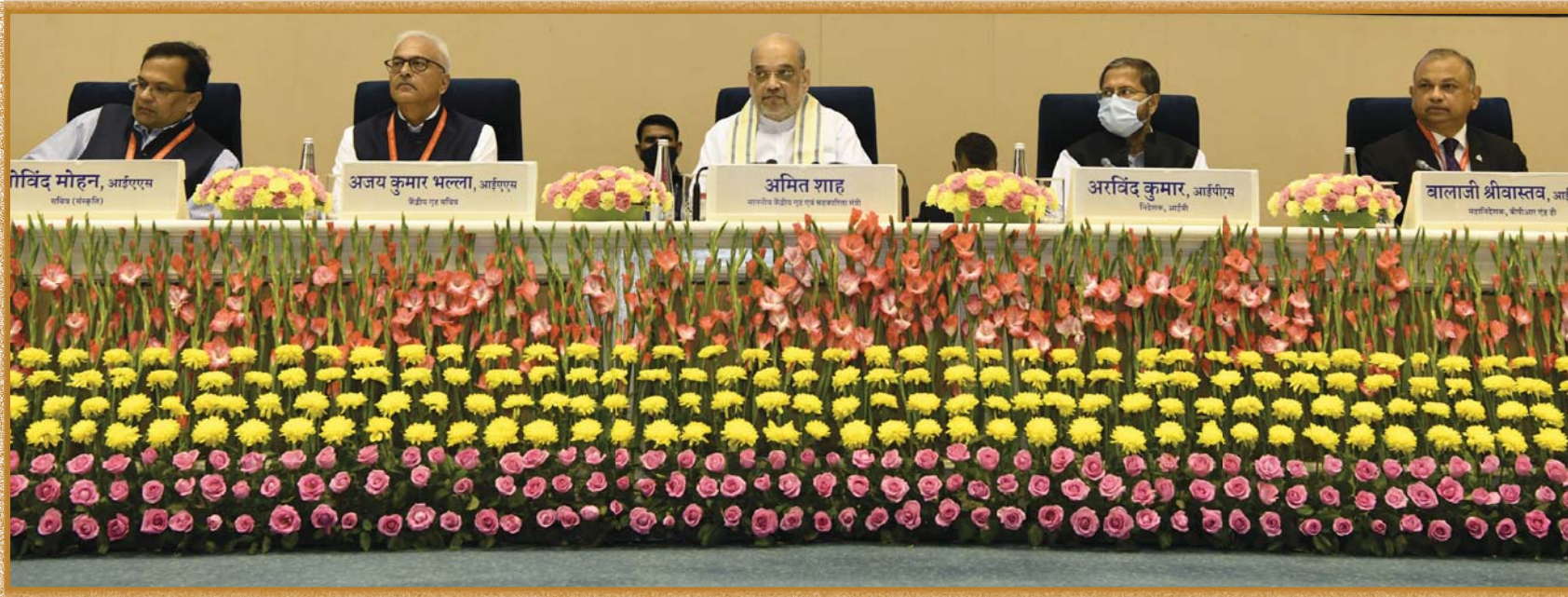
Hon'ble Union Home and Cooperation Minister, Sh. Amit Shah Ji and other dignitaries at Vigyan Bhawan, during 'National Conference on Cyber Safety and National Security'

Newsletter of the Bureau of Police Research and Development, Ministry of Home Affairs, Govt. of India