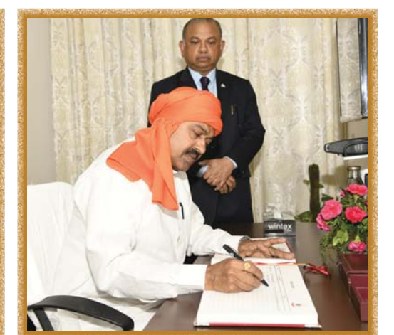
Hon'ble MoS (Home), Sh. Ajay Kumar Mishra Ji minuting the visitor's book