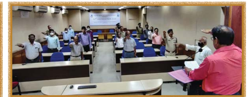
Oath Ceremony at CDTI Kolkata