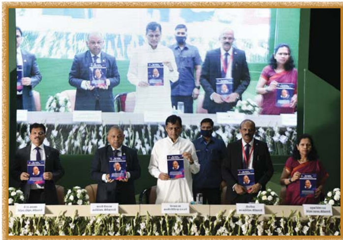
Hon'ble MoS (Home), Sh. Nityanand Rai Ji and other dignitaries releasing the IPJ