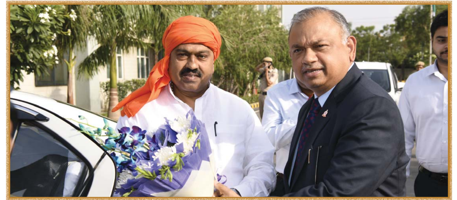
DG, BPR&D, Sh. Balaji Srivastava welcoming the Hon'ble MoS (Home), Sh. Ajay Kumar Mishra ji